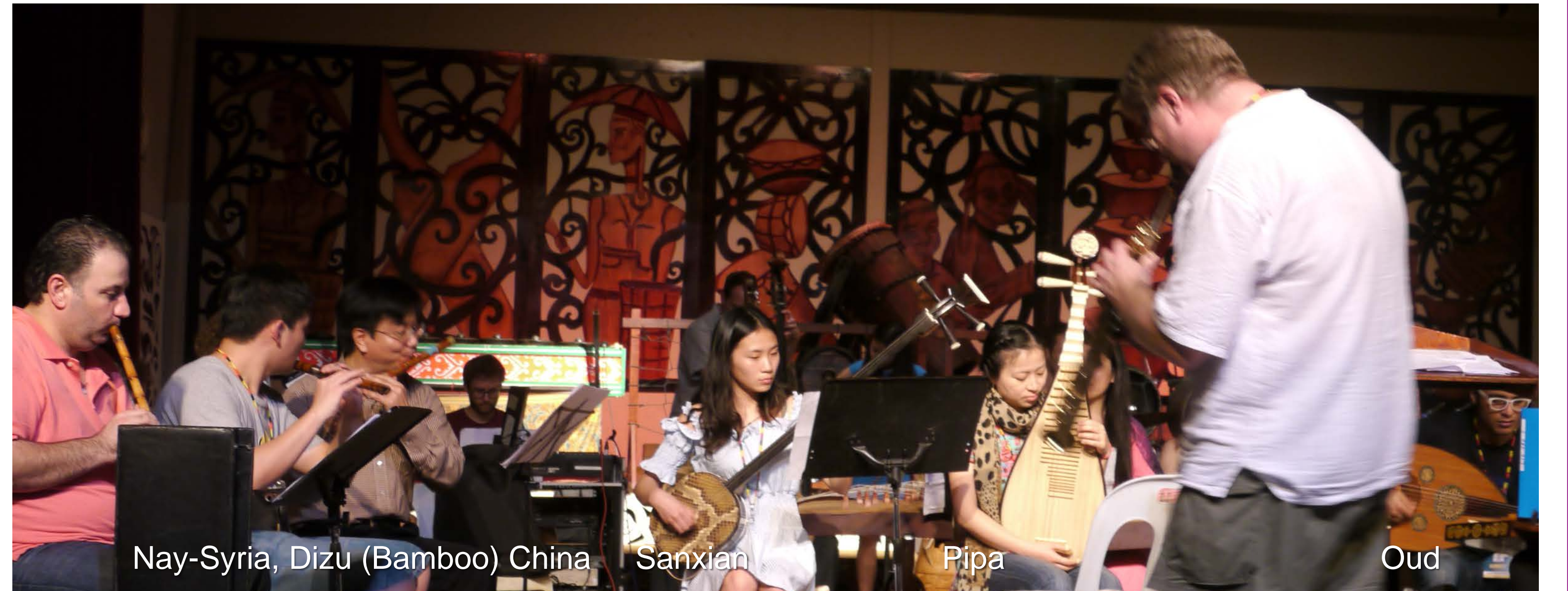
Nay-Syria, Dizu (Bamboo) China

The aim of this project was to develop the basis for new orchestral music, combining elements from western, ethnic and electronic music and new strategies for large orchestras. The important phases of the project were: • November 2014 visiting the music department, University of Suzhou China • December 2014 preparing compositions & arrangements for Glomus Camp • January 2015 leading the Glomus Orchestra in Kuching, Borneo, Malaysia • April 2015 working with the Glomas Orchestra for the RAMA festival